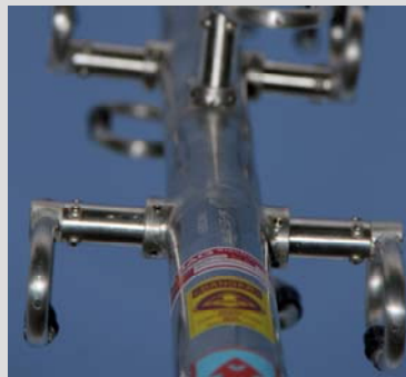
Fully sealed internal phasing harness