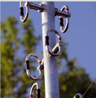
Expert TIG welding